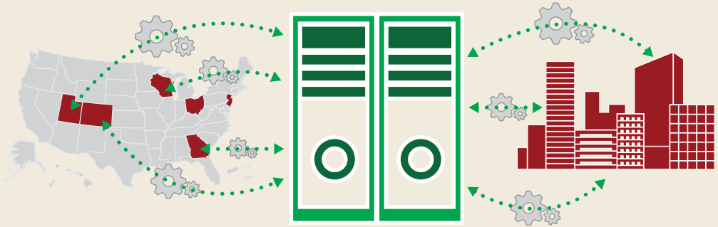
State UI Agency Systems

OPTION 1: SIDES provides an automated data-sharing and file-tracking interface between employers'/TPAs' IT systems and state UI agency networks. SIDES is an integrated computer-to-computer interface designed for employers and TPAs who typically deal with a large volume of UI information requests . SIDES is especially helpful to those who operate in multiple states.